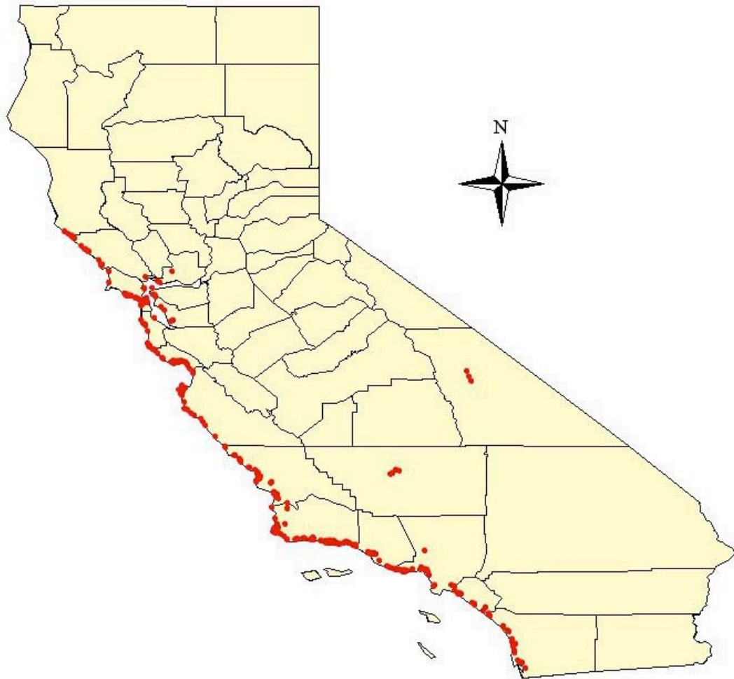
Figure 1. Location of monarch overwintering sites in western North America. Several habitats between the U.S. border and Ensenada, Baja California are not shown. Data source: California Fish and Game Natural Diversity Data Base.