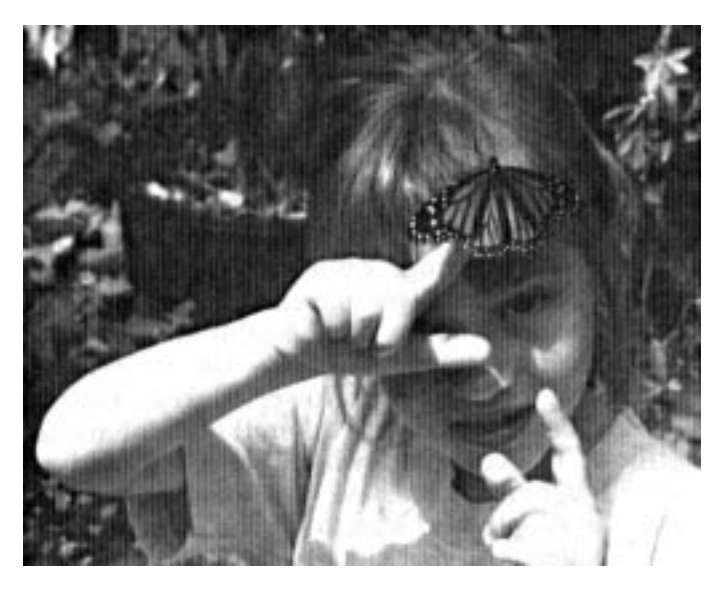
Classroom Field Trips

Children never forget a special experience. The Monarch Program offers a one hour curriculum for children, preschool through high school. Younger children will learn about a butterfly's life cycle, anatomy, and behavior from videos, slides, art projects, study sessions, and hands-on activities. In the Butterfly Vivarium, students can get face to face with live butterflies, see their eggs, handle caterpillars, and often witness butterflies emerging from chrysalises. Older children can do biology and behavioral studies, field surveys, and tag monarchs.